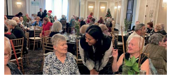
Christmas dinner with Carrefour Montrose

This year once again, my team and I were happy to support community organizations during the Holiday Season: sharing stores, making baskets, transportation and more!