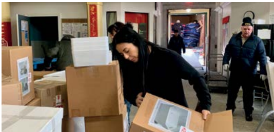
Unloading of a delivery for the next bazaar of the Hochelaga Community Center