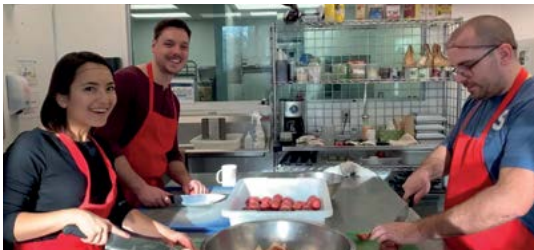
Volunteering for the Hochelaga-Maisonneuve Collective Kitchen