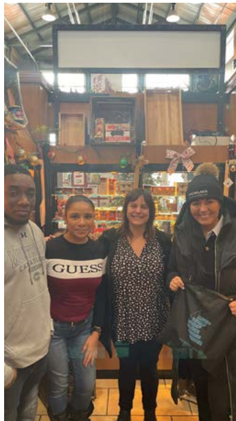
Some shopping at the Habitations L'Escalier market