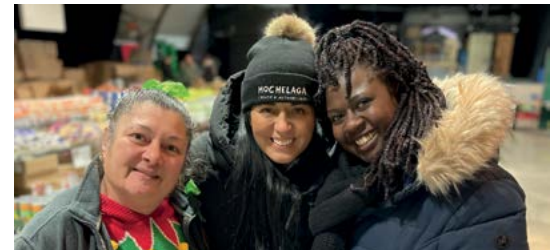
Preparation of food and support for families at the Hochelaga-Maisonneuve sharing store