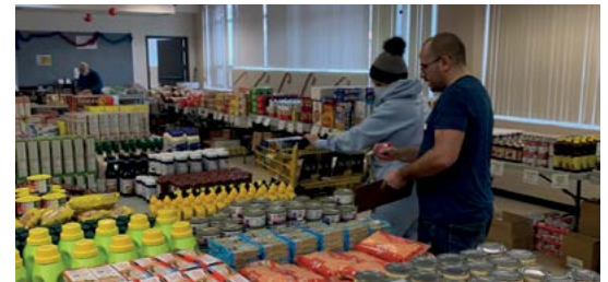
Support for families during the 30 th edition of the Rosemont sharing store

In 2022, nearly $36 million was invested in Hochelaga projects. Here are some concrete examples: