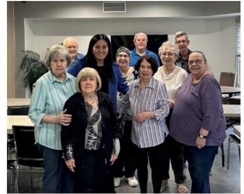
With residents of the Jardins de l'Aubade

Do you want to get involved? Call 514-447-8114 or write to info@frigodelest.org