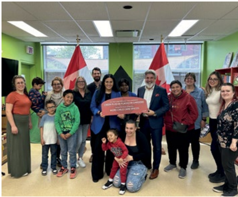
Thank you to Carrefour Familial Hochelaga for providing the venue for us to share this great announcement!