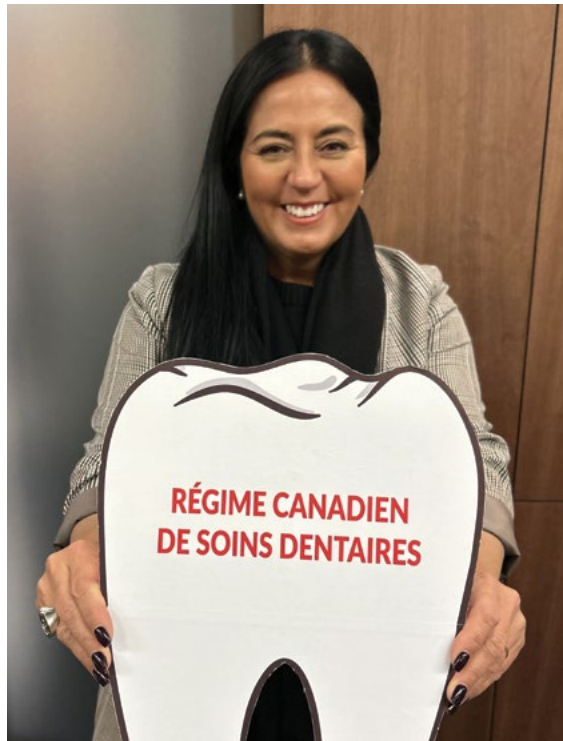
Soraya Martinez Ferrada Member of Parliament for Hochelaga

Have a great summer and I look forward to meeting you in the streets of Hochelaga!